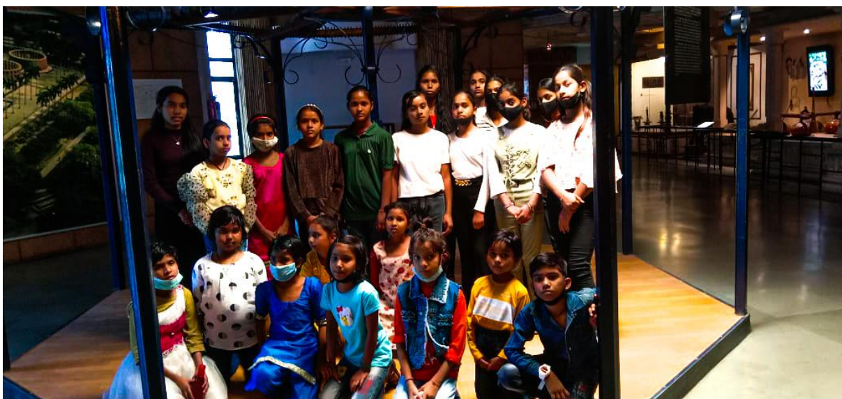
(Visit to Nehru Planetarium (Tara Mandal) by group of children)