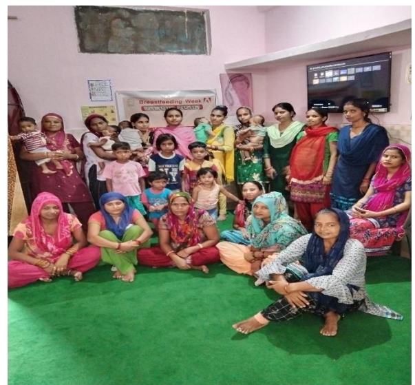
(Group of Pregnant women & lactating mothers)