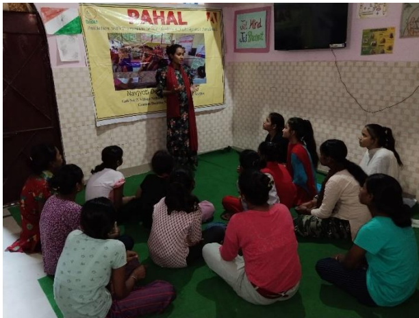
(Adolescent orientation & education)