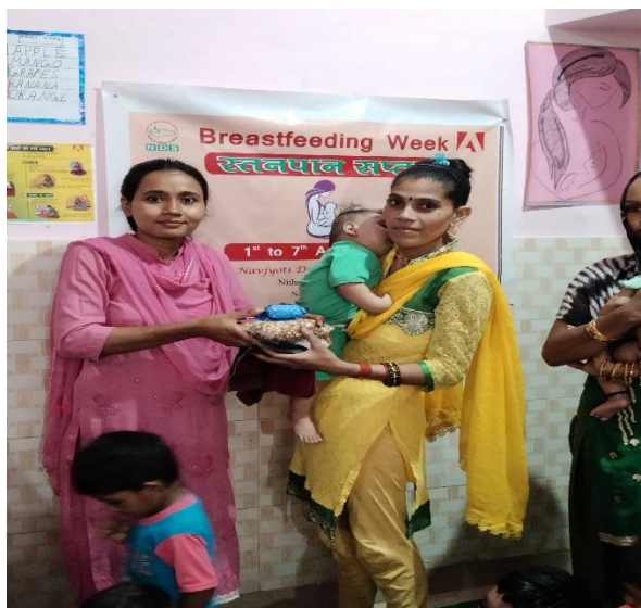
(Distribution of food & Nutrition)