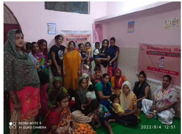
(A group of pregnant women & mothers)